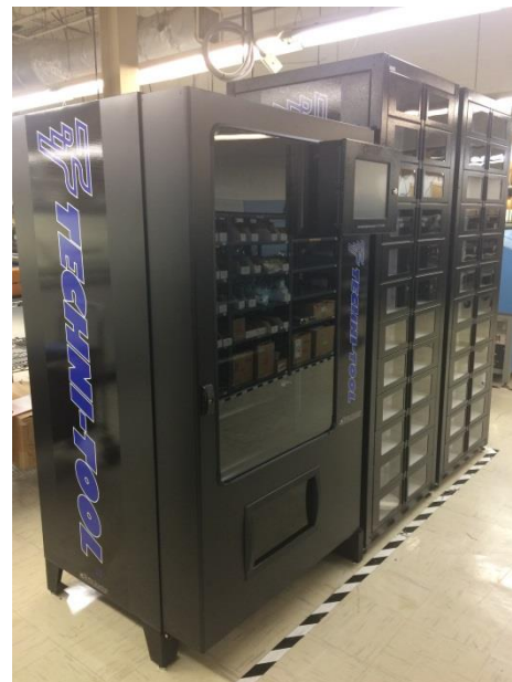
The Ivyland Tool Crib